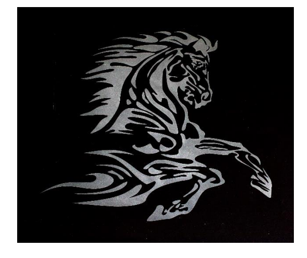
Sandblasting Surface Etch

Surface etching is a single uniform blasting that produces a uniform texture.