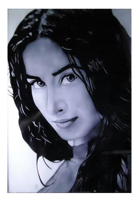
Sandblasting Shading by Harish Dewani

Multi-stage blasting is when a strong contrast is created by removing part of the stencil and blasting long enough to cut deeply into the glass - then removing the rest of the stencil to surface etch the rest of the design.