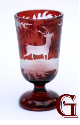
Sandblasted red flashed glass goblet

Flashed glass is glass in which a thin layer of colour has been applied over another colour. Usually clear or white base. Cutting through the thin coloured top layer (with acid etching, engraving, or sandblasting) exposes the base colour in contrast.