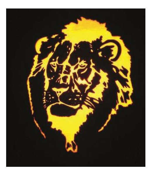
Kilnformed flashed glass

If you just keep blasting straight at the glass, you won't blast out a square trench but instead will blast out a curved scoop – deep in the middle and