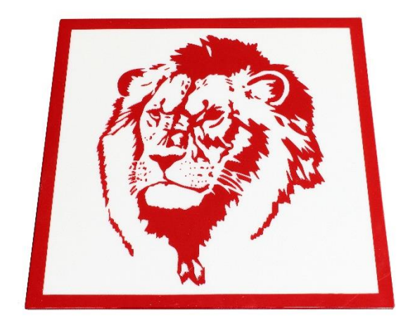
Painted on sandblasted glass

Sandblasting is an excellent way to apply tooth to glass to get paint to stick. The paint will stick CONSIDERABLY better to a surface that has been roughed up from sandblasting than it will to smooth glass.