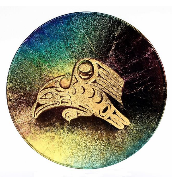
Gold mica applied on sandblasted iridescent black glass