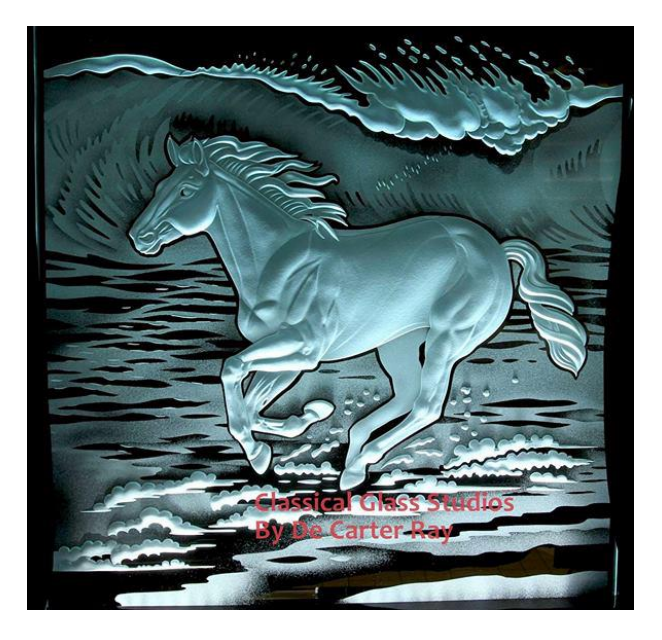
Sandblasting Carving Work by De Carter Ray

Surface etching and shading are done by blasting straight on. Carving is done by changing the angle of the gun to create different curves and contour shapes.