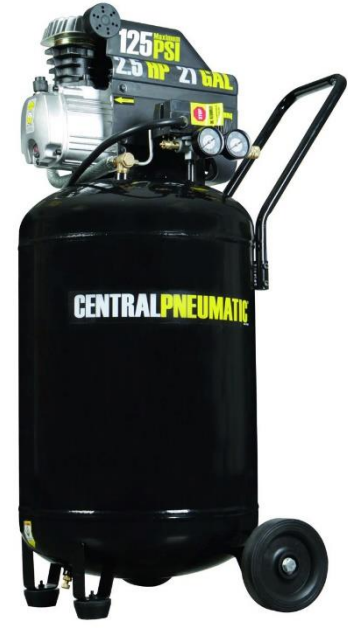
Small Air Compressor

A compressor is used to apply a high pressure jet of air to blast the abrasive material.